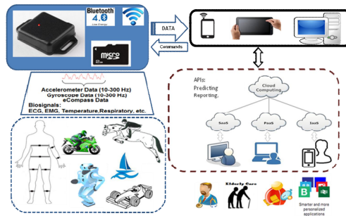
Figure 1. Data logger and its applications.

The backbone of the system was Wi-Fi communication between each data logger with the server. For this purpose ESP8266 was used and programmed as a client to communicate with a web server. To enable this data logger to apply as a wearable device, a Lithium polymer battery (3.7 v, 440 mAh) was implemented and a battery charger chip was used to supervise the battery voltage and charging. A high-efficiency step-up DC-DC converter was mounted on the board to regulate the battery voltage at 3.3 v. The ESP8266 has no flash memory, therefore a 32 Mbit flash memory implemented in this data logger and a MicroSD card socket was mounted and connected to ESP8266 SPI port for offline data storage in FAT32 format on a 2GB MicroSD card.